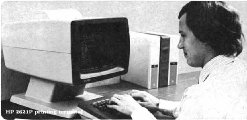
HP 2621P printing terminal